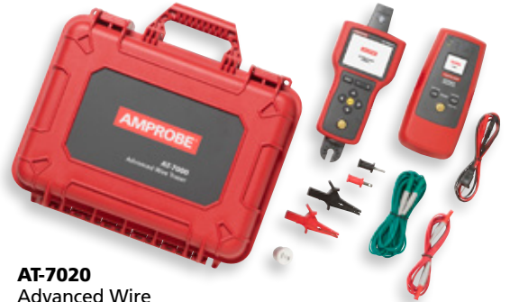
AT-7020 Advanced Wire Tracer Kit