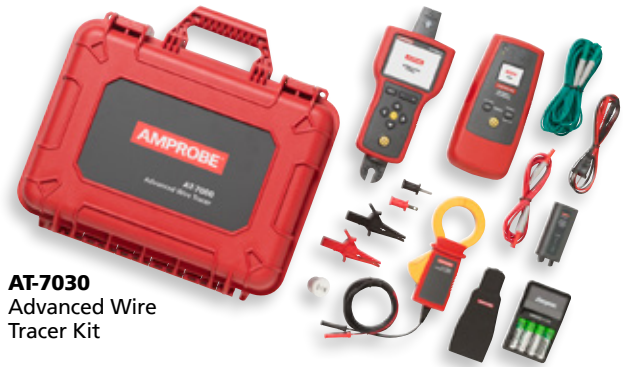
AT-7030 Advanced Wire Tracer Kit