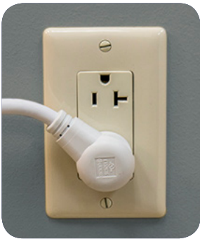
45° Angle Plug (15A only)

Green LED indicates surge protection working