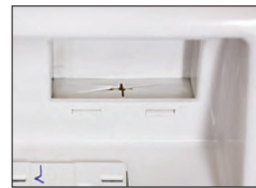
Flexible Screen closes interior opening of the Mid-Size Plate