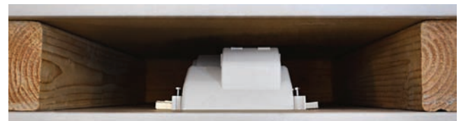
Top View - Mounted Between Studs