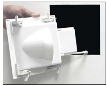
45-0031-WH – Back View

DataComm Electronics, Inc. 6349 Peachtree Street Norcross, GA 30071-1725 888.223.7977 770.662.8205 www.datacommelectronics.com