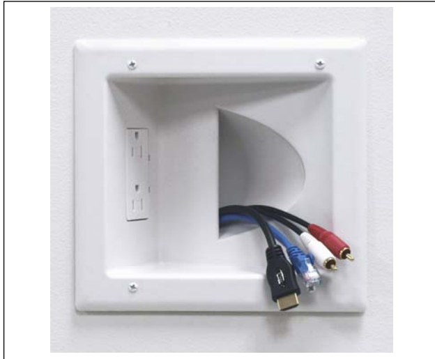
45-0031-WH - Front View