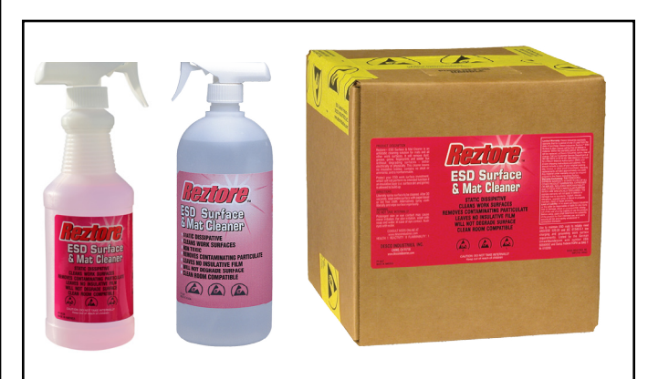
Figure 1. Reztore™ Surface & Mat Cleaner: 16 Ounces (500 ml) Spray Bottle 1 Quart (1 liter) Spray Bottle 2.5 Gallons (10 liters) Bag-in-Box