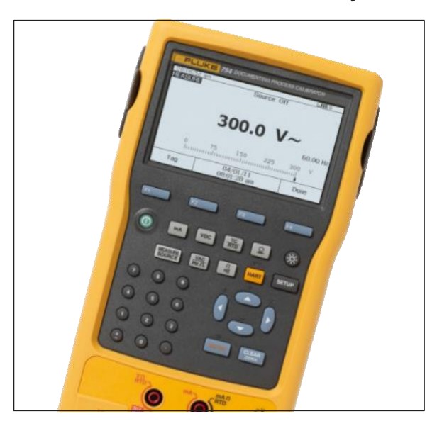
Fluke 754: The HART calibrator that is easy to use.