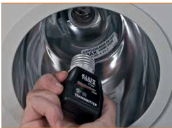
Light Socket Adapter