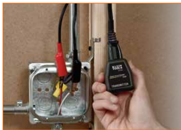
Alligator Clip Adapter for Bare Wires Kit 69411