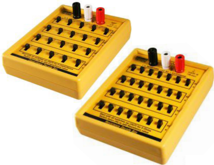
Resistance Decade Box Model: 72-7265 and 72-7270