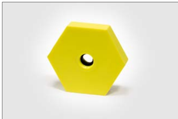
RFID HEXTAG – For applications where a RFID cable tie solution is not suitable.