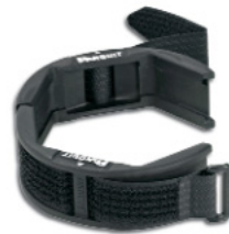
Jacket Cover with Hook and Loop Fastener

The PANDUIT cable bundle organizing tool efficiently arranges up to 24 data cables to optimize bundle size and improve installed appearance. The organized cables can then be easily secured using PANDUIT ® TAK-TY ® Hook & Loop Cable Ties. Two insert sizes accommodate a wide range of cable diameters for greater installation flexibility. The tool's ergonomic, compact design is comfortable for installers to handle and also works well in tight spaces. This user-friendly tool reduces cable installation time up to 50%.