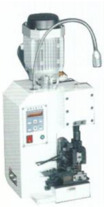
FLH-CT-0-02 CRIMP MACHINE WITH APPLICATOR