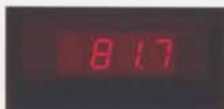
DPM 48 / 2000 SNT 13 Standard format, transformer supply