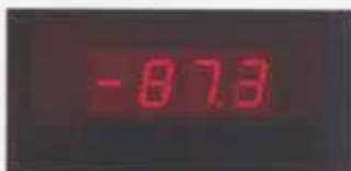
DPM 48 / 2000 SN 13 Standard format, universal supply.