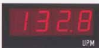
DPM 48 / 2000 SN 20 Large display, universal supply.