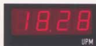
DPM 48 / 2000 SNT 20 Large display, transformer supply