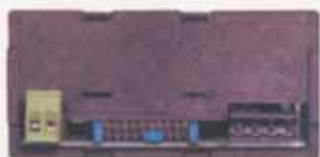
DPM 48 / 2000 SN Rear view.