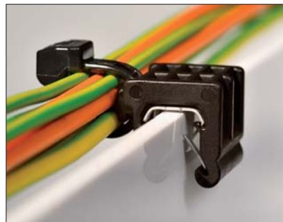
T50ROSEC23 - the cable bundle runs parallel with the edge.