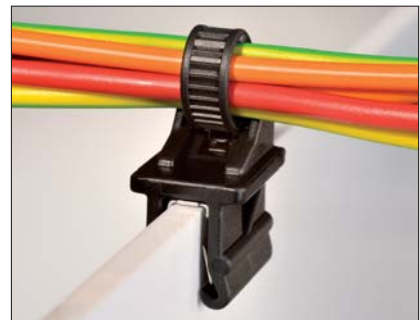
1-Piece-Fixing Tie T50SOSEC12 can be pushed easily on edges.