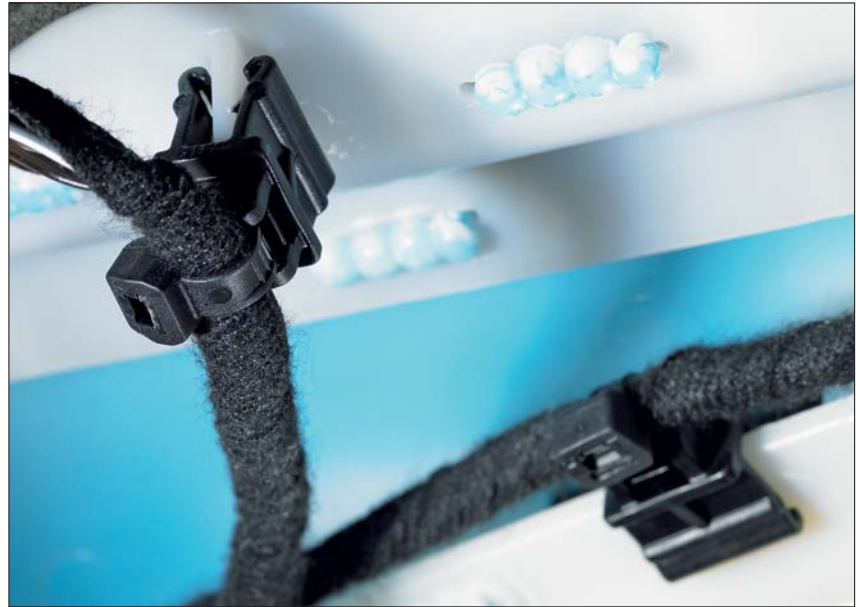
T50ROSEC10 fitted onto a plastic panel to hold a Ø 6mm harness.

These cable ties and Edge Clip assemblies are ideal for use where holes are not acceptable or where due to temperature problems adhesives will fail. These assemblies are widely used for fixing and bundling cables, pipes and hoses within the automotive industry, harness making, panel building and electrical industry.