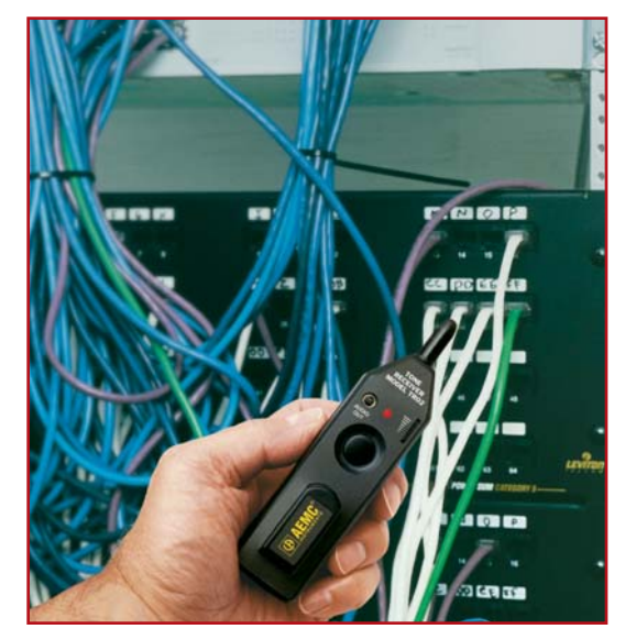
Model TR02 used to find cables in a panel.