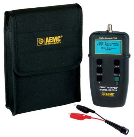
Model CA7024 includes meter, soft carrying case, BNC pigtail cable with alligator clips, four x 1.5V AA batteries and user manual