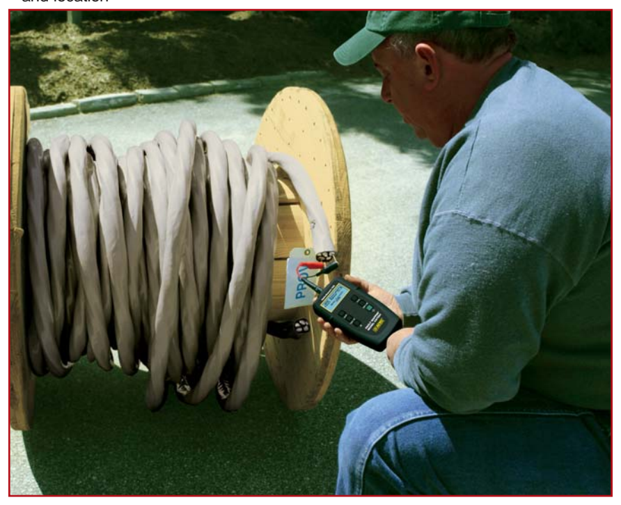
Model CA7024 checking the length of power cable on a reel.