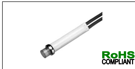
Minimum panel thickness: 0.030"