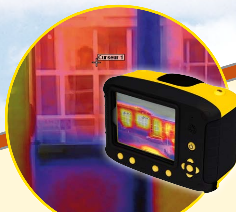
Thermal insulation inspection