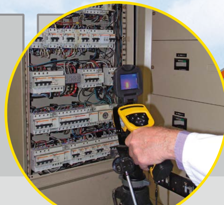
Inspection of electrical cabinets