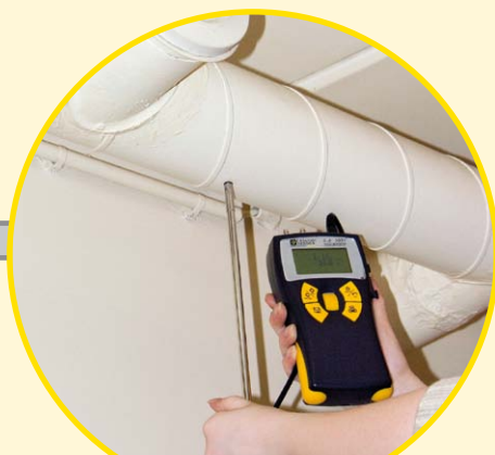
Ventilation duct inspection