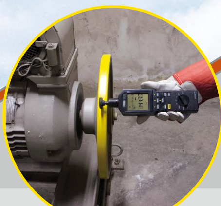
Rotation speed measurement