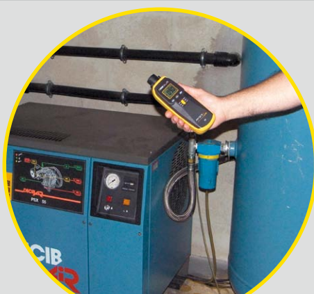
Carbon monoxide level detection