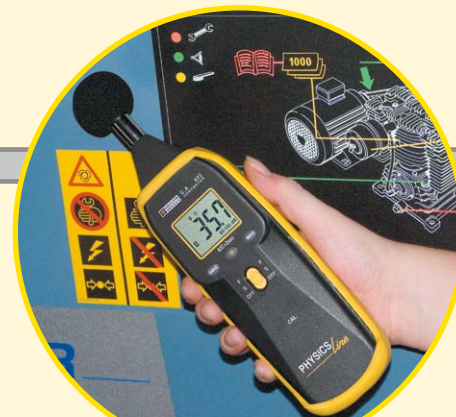
Sound level measurement