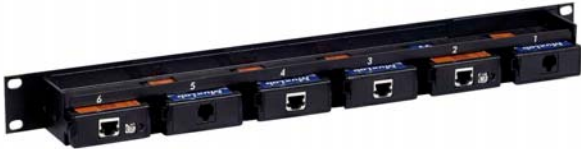
Fully loaded - rear view