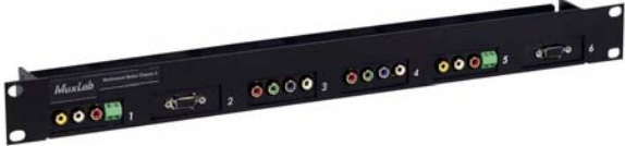
Fully loaded - front view