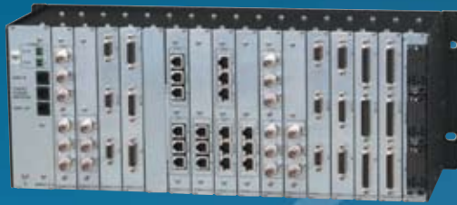
SM500A: rear view: shown with various interface cards loaded. Cards not included.