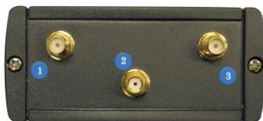
Figure 2. Router back panel view.