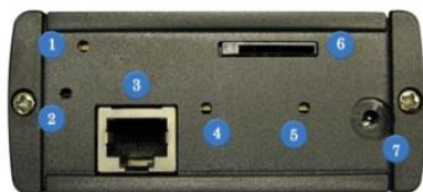
Figure 1. Router front panel view.