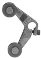
90° Forked Arm 1 1/2" Length