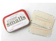
Adafruit Perma-Proto Small Mint Tin Size Breadboard PCB - 3 pack