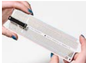
Adafruit Perma-Proto Raspberry Pi Breadboard PCB Kit