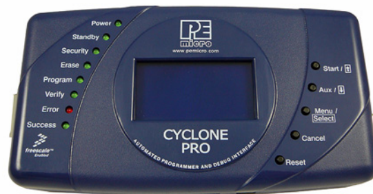
P&E's Cyclone PRO

The USB BDM MULTILINK is intended for development and is not designed to accommodate the demands of production programming. However, P&E's Cyclone programmers are specifically engineered to withstand the rigors of a production environment and will provide a seamless transition from the USB BDM MULTILINK. More information is available at: http://www.pemicro.com/cyclone