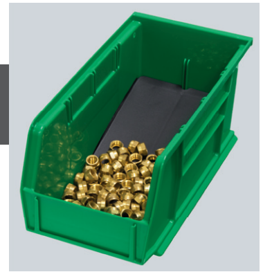
Keep parts close to the front of the bin within easy reach