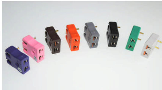
'Specially designed for PCB mounting'