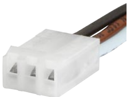
Wire Harness Wire harness for SCHURTER products