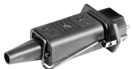
Cord retaining kits Cord retaining strain relief