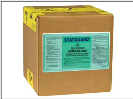
Figure 1. Statguard® Dissipative Neutral Floor Cleaner