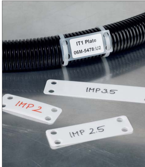
Unlimited cable bundle diameters can be securely identified.

If needed, IT and IMP plates can be written on with T82 marker pens. They can also be direct-printed using the hot stamping process. Just ask us.