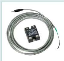
Optional AC or DC Alarm relay module with 9 foot (3m) cable