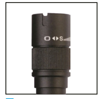
Twist Head Focus Control