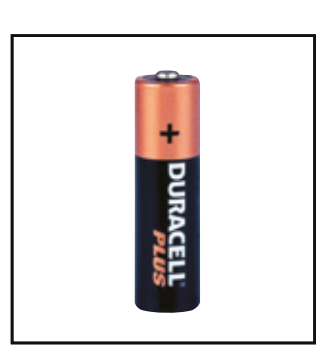
1 x AAA Battery (Included)