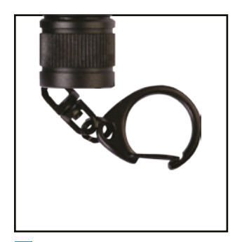
Keyring Chain For Portability