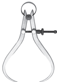
950-221 Outside spring calipers