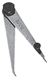
950-241 Hermaphrodite calipers