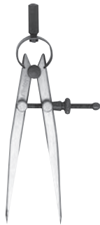
950-211 Spring divider