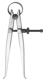
950-231 Inside spring calipers