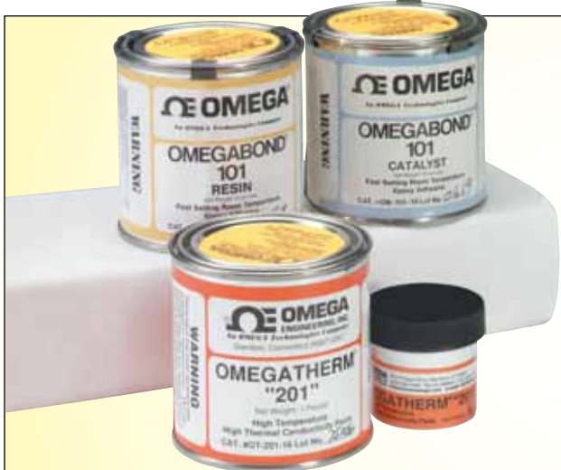
OMEGABOND®, see accessory chart or visit newportUS.com for additional information.