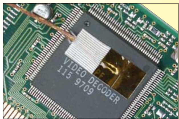
The self-adhesive mounting strip is ideal for “targeted” placement of the sensor element. Once the element is in place, it can be used “as is”, for applications such as electronic component temperature monitoring during board fabrication. It can also be cemented in place using OMEGABOND® for higher temperatures.