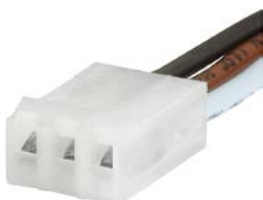
Wire Harness Wire harness for SCHURTER products