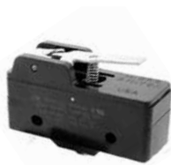
BZ, BA, BM, BE Series