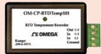
OM-CP-RTDTEMP101 precision datalogger, visit newportUS.com/om-cp-rtdtemp101