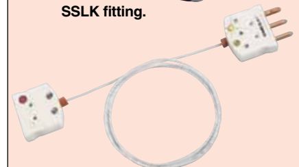
TECU10-MTP extension cable.