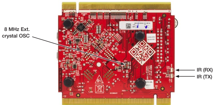
Figure 2: Back side of TWR-KL43Z48M module