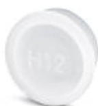
Plastic dust protection cap with IP40 eye for connectors with M23 external thread, RF, SF series

Plastic dust protection cap - SF-Z0019 - 1607449