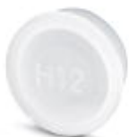
Plastic dust protection cap with IP40 eye for connectors with M23 external thread, RF, SF series

Plastic dust protection cap - SF-Z0019 - 1607449