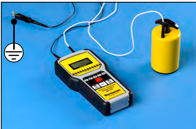
Figure 5. Rg test setup

If the measurement is outside acceptable limits, clean the surface with an ESD cleaner containing no insulative silicone such as Rezfore™ Antistatic Surface & Mat Cleaner , and re-test to determine if the cause of failure is an insulative dirt layer or the ESD worksurface material.