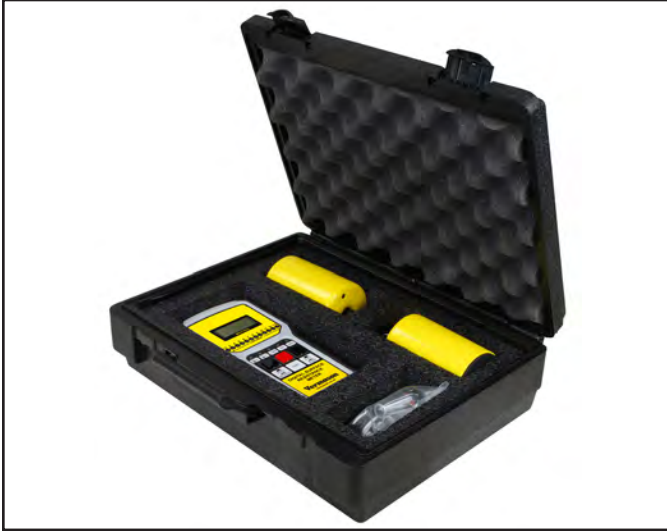
Figure 2. Vermason 222642 Digital Surface Resistance Meter Kit