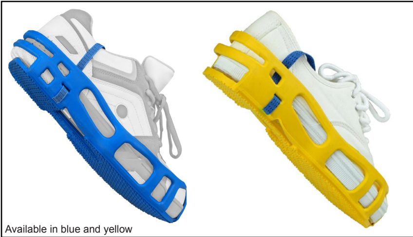
Available in blue and yellow