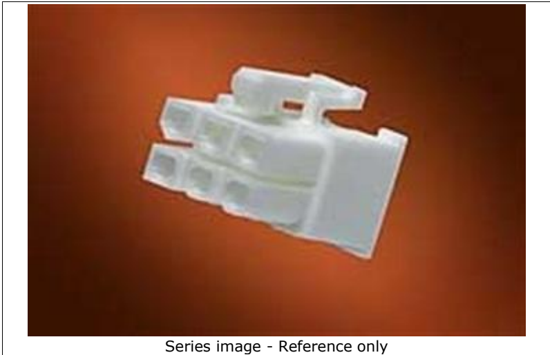
Series image - Reference only