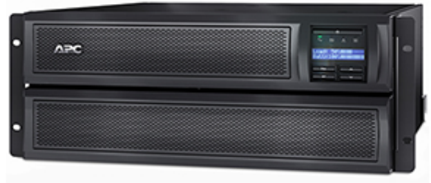
APC Smart-UPS X 2000VA Rack/Tower LCD 100-127V Part Number: SMX2000LV