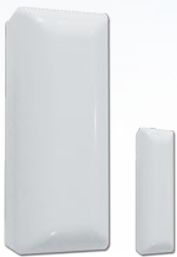
Wireless Reed Switch Model: WREEDI

Easily expand your system with door/window security, fire detection and emergency response