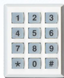
Wireless Mini Keypad Model: WKP