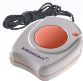
Panic/Emergency Pendant Model: WPNIC