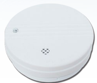
Wireless Smoke Detector Model: SMOETW