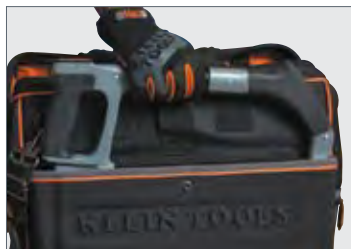
Top-loading hacksaw pocket with protective plastic lining.