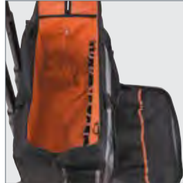
Wide open interior to accommodate large tools.