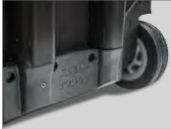
Molded kick plate to protect from the elements.