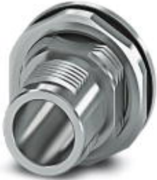
Housing screw connection, PlugLink:M12-SPEEDCON, Rear mounting, M15 x 1

Please be informed that the data shown in this PDF Document is generated from our Online Catalog. Please find the complete data in the user's documentation. Our General Terms of Use for Downloads are valid ( http://phoenixcontact.com/download )