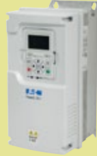
PowerXL™ DG1 General Purpose Drive

PowerXL™ DG1 general-purpose drives are variable frequency drives in Eaton's „Next-Generation“ PowerXL™ series. They are specifically designed for modern, sophisticated applications: In fact, energy-saving algorithms, high short-circuit values, and a heavy-duty design all enable them to provide maximum efficiency, safety, and reliability.