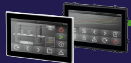
XV300 —HMI/PLC with multi-touch technology