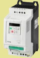
PowerXL™ DA1 Advanced Machinery Drive

The DS7 soft starter is ideal for applications like pumps, fans, and small conveyor belts. It is a fully integrated xStart system module. DS7 units not only replace the mechanical contactor, but also add a "soft motor startup" function to it. Additional advantages include longer service intervals and reduced operating costs.