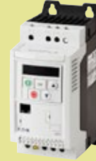
PowerXL™ DC1 Compact Machinery Drive