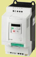
PowerXL™ DL1 Elevator Drive

The PowerXL™ DL1, also known as the elevator version of the PowerXL™ DA1, is designed for use with motors with up to 100 poles and PM motors. It's designed with specific functions for elevators that make it easy to integrate it into new elevator systems and retrofit it into existing ones.