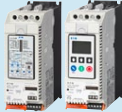
S801+ / S811+