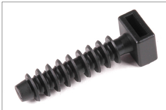
LOK01, LOK01B, LOK01S fixing bases.