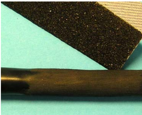
Cable Jacket Abrasion

Ensure sufficient cable jacket has been abraded to incorporate the strip length requirement.