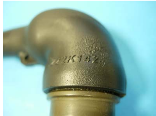
NOT ACCEPTABLE Scorch Marks