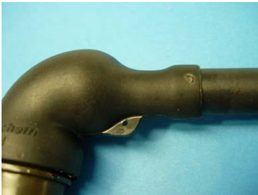
NOT ACCEPTABLE Necking