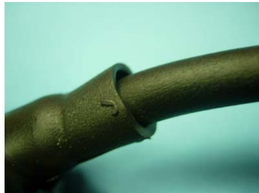
NOT ACCEPTABLE Under Recovered