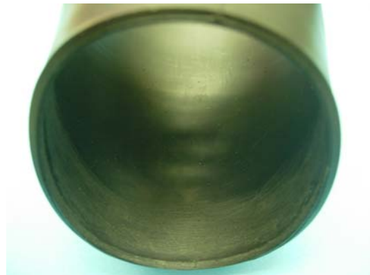
Moulded Part Abrasion

This part of the cable preparation is very important in ensuring a strong bond to the moulded part.