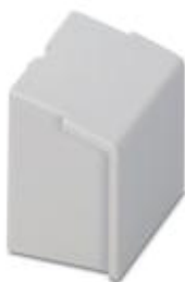
Component housing, Color: light gray

Please be informed that the data shown in this PDF Document is generated from our Online Catalog. Please find the complete data in the user's documentation. Our General Terms of Use for Downloads are valid ( http://phoenixcontact.com/download )