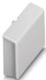
Component housing, Color: light gray

Please be informed that the data shown in this PDF Document is generated from our Online Catalog. Please find the complete data in the user's documentation. Our General Terms of Use for Downloads are valid ( http://phoenixcontact.com/download )