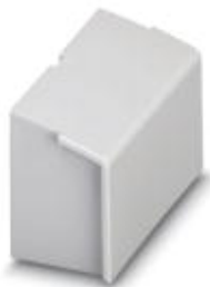
Component housing, Color: light gray

Please be informed that the data shown in this PDF Document is generated from our Online Catalog. Please find the complete data in the user's documentation. Our General Terms of Use for Downloads are valid ( http://phoenixcontact.com/download )